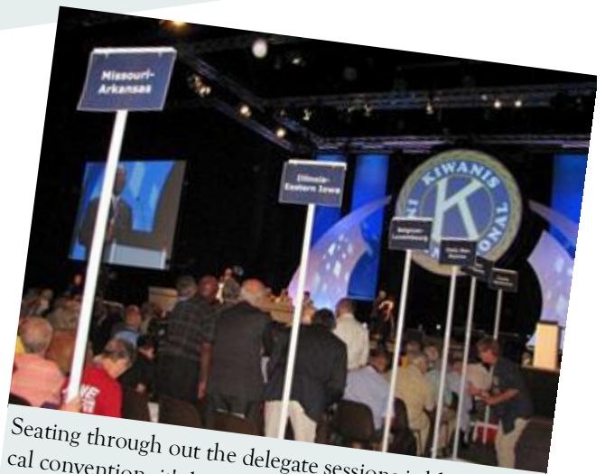
Seating through out the delegate sessions is like a political convention; it's by Districts so we can consult with each other.